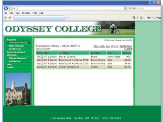
Transaction history screen*

Ad-free: NetCardManager does not feature any advertising.