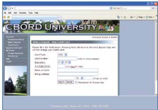
Online deposit screen*