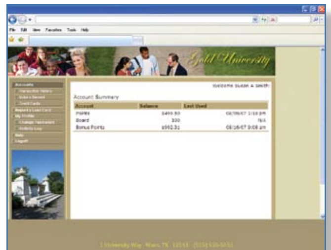
Balance inquiry screen*